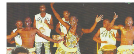
Kassou-Tri, a group of Ivorian musicians, is scheduled to tour Japan from Oct. 18 to Nov. 13, 2018.

d'Ivoire and Japan, the cultural, social and training exchanges should be highlighted. Training is offered every year in various sectors to young Ivorian people in the context of a short or long stay in Japan, including scholarships following the framework of the African Business Education Initiative for Youth.