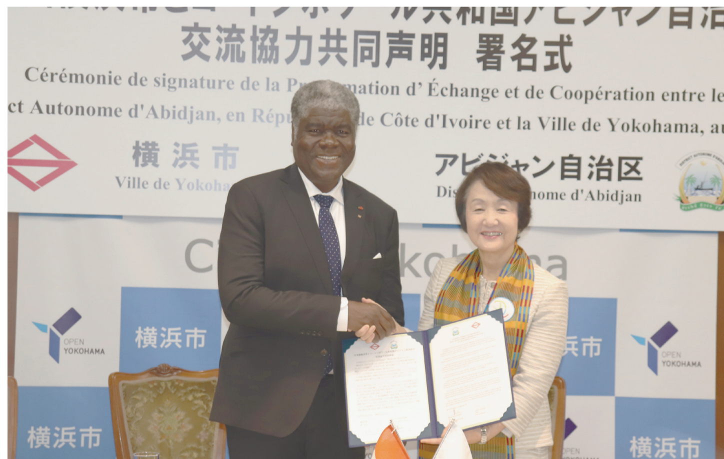
Gov. of the Autonomous District of Abidjan Robert Beugré Mambé and Yokohama Mayor Fumiko Hayashi hold the signed agreement for exchange and cooperation between Abidjan and Yokohama at a ceremony in September 2017.

This content was compiled in collaboration with the embassy. The views expressed here do not necessarily reflect those of the newspaper.