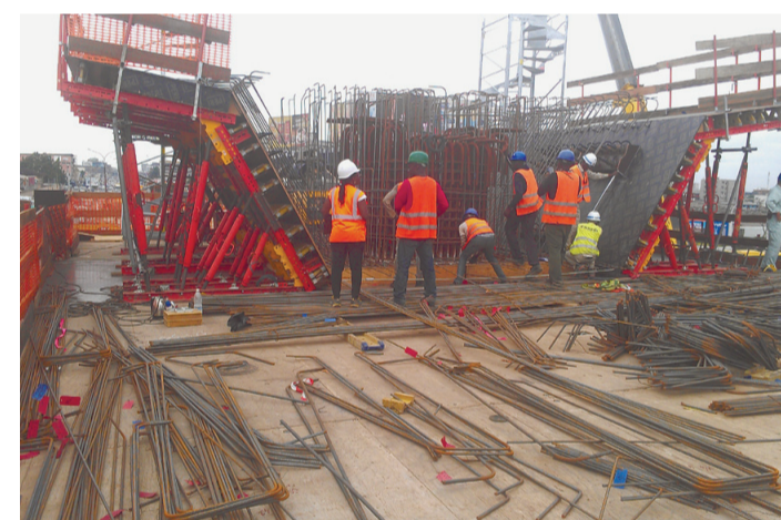
Construction of the Japan-Côte d'Ivoire Friendship Interchange in Abidjan is underway.

Congratulations to the People of the Republic of Côte d'Ivoire on the 58th Anniversary of Their Independence